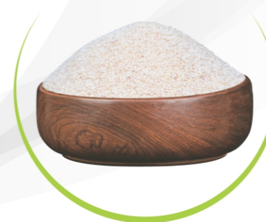
Dehydrated Garlic Granules

Commonly used for bottled packs for retail stores used in sauces, salad dressings canned & prepared foods, meat bolls, dry casserole mixes.