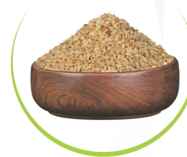
Dehydrated Garlic Chopped

Applied mainly for canned soups, salads, hamburgers, pizzas & other fast food preparations when garlic appearance & textures is desired.