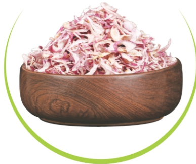
Dehydrated Red Onion Kibbled