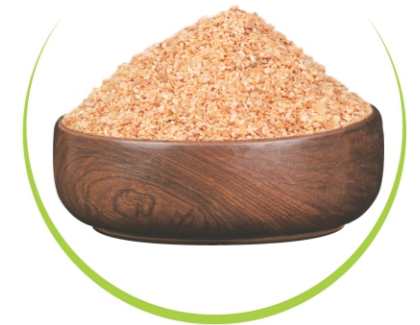
Dehydrated Garlic Minced

Vastly used in varied food preparations whenever strong garlic flavor & taste are desired. Mainly utilized for pickles, sauces, canned/prepared meat or vegetables, dry mixes ethnic foods.