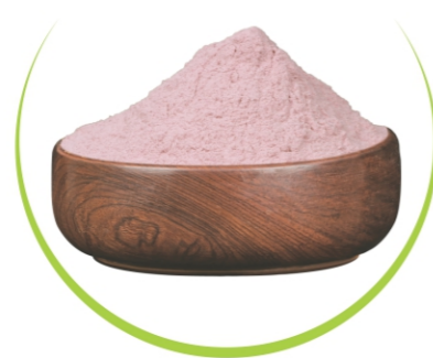
Dehydrated Red Onion Powder

Dry soups or dip mixes, Specialty / ethnic canned, dry foods, in food service and consumer packs whenever Red Onion colour is preferred.