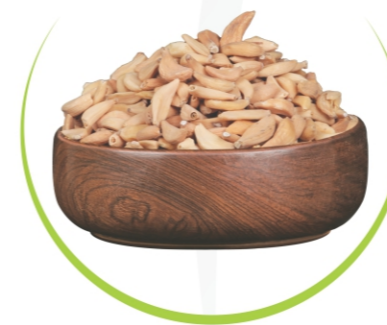
Dehydrated Garlic Flakes