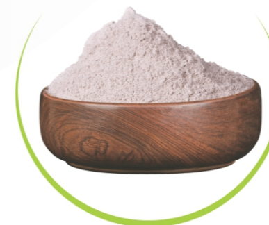
Dehydrated Garlic Powder

Mainly used in salad dressing, gravies, sauces, seasonings, cheese snacks etc. suitable for metering devices. Utilized extensively by food service / restaurants in bottle packs or garlic salt retail sales.